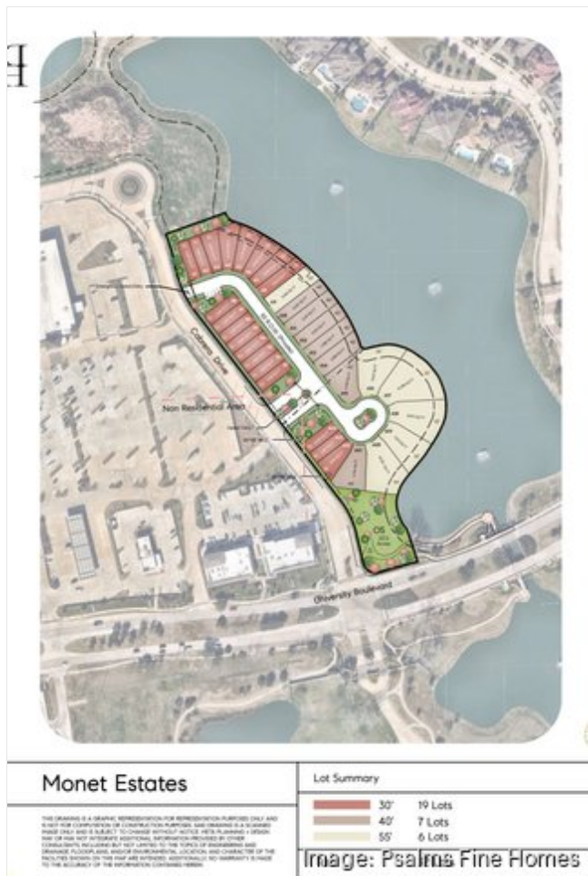
Site map of Monet Estates

The homes will feature classic French exteriors with cast-stone balconies, arches, awnings, wood garage doors, gaslights and flat-tile roofs. Three-car tandem garages will be available on some of the floor plans. Each home will have three exterior elevation choices and an option for an elevator. The majority of the homesites are on the water, including all six 55-foot lots, while 12 are along Cabrera Drive, according to the site plan.