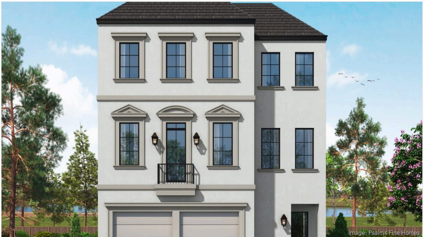
Rendering of the 40-foot lot model home in Monet Estates