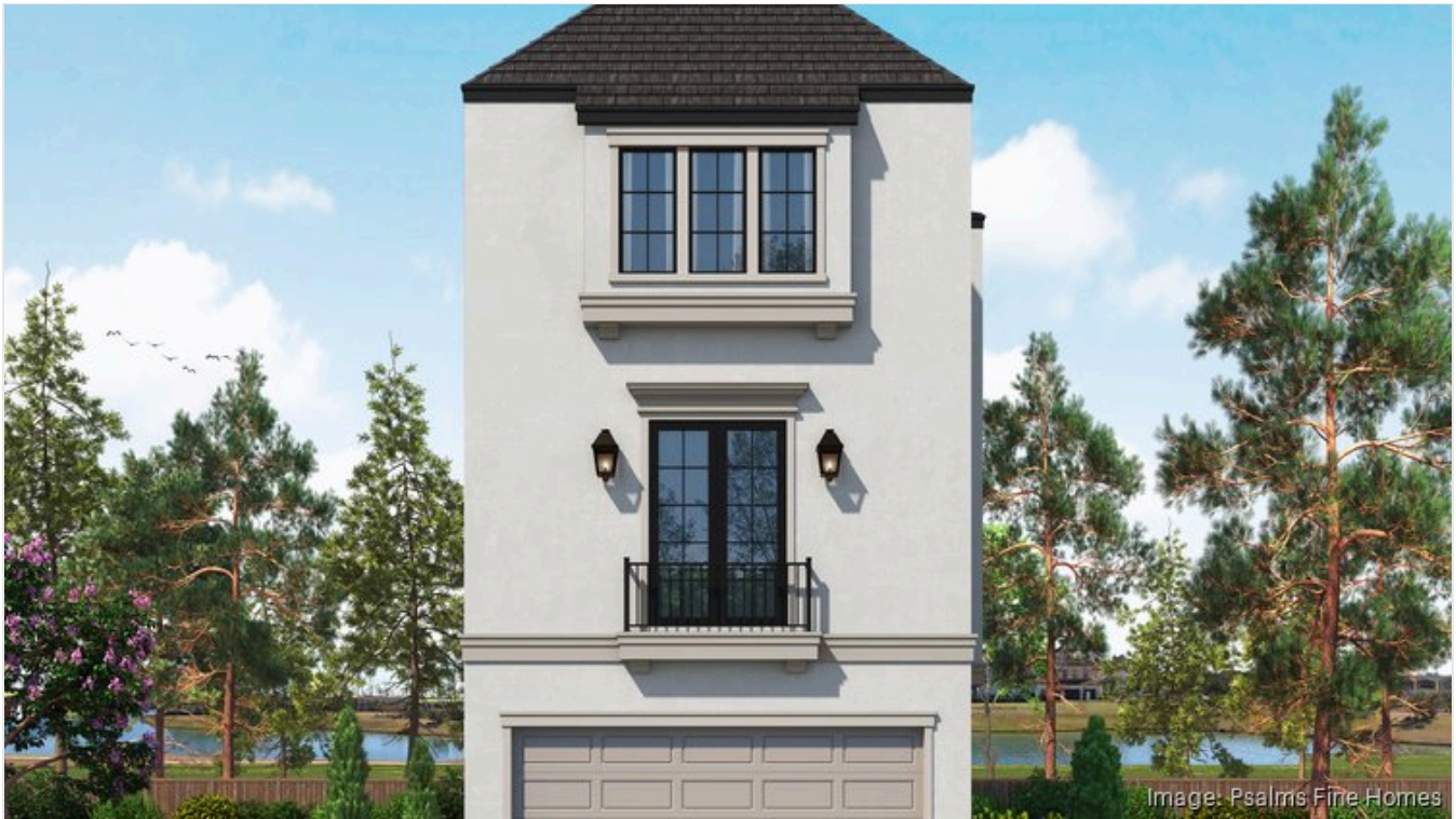
Rendering of the 30-foot lot model home in Monet Estates